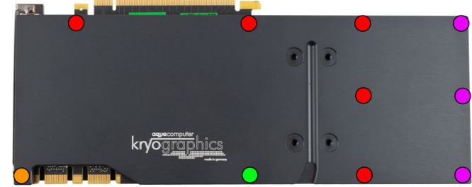
Attach back plate and graphics card to the water block. To do so, use the following mounting

Turn the back plate upside down and place it onto the graphics card. Make sure that none of the plastic spacers dislodge from the back plate.